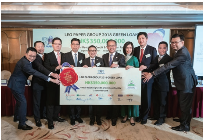
2018 Green Loan Signing Ceremony 2018年綠色融資簽約儀式