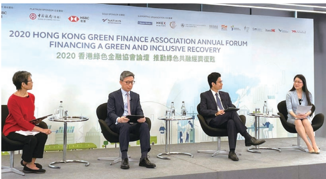
Hong Kong Green Finance Association Annual Forum 香港綠色金融協會論壇

中銀香港一直以負責任的方式經營信貸業務，制定了《企業社會責任信貸管理》政策，以支持社會可持續發展為原則，優先考慮在社會和環境方面具備可持續性的項目。我們也密切留意新興綠色行業動態，支持綠色信貸，定立針對性的策略，邀請重點企業客戶合作，鎖定綠色建設、綠色能源、綠色運輸、環保相