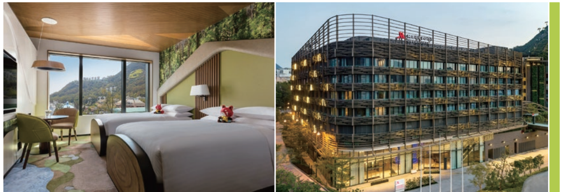
Marriott Hotel Ocean Park 海洋公園萬豪酒店

In Hong Kong, we have worked closely with Lai Sun Development Group & its wholly-owned subsidiary Capital Court Limited, to achieve a few significant company and industry “ firsts ” in Hong Kong’s promising green financing space.