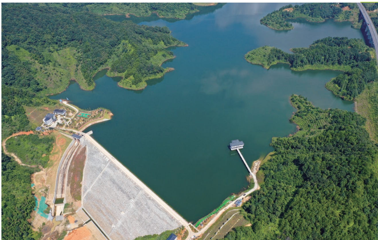
全省首單水利ppp項目 — 太湖水庫