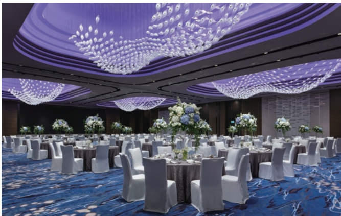
Grand Ballroom 大宴會廳

香港海洋公園萬豪酒店位於香港島南部，是一個擁有三幢樓宇的酒店項目，建築面積約365,974平方呎。該酒店地上6層，地下2層，共471間客房，於2019年2月19日正式開始營運，擁有特色餐廳包括：裝修以美國1920年代禁酒時期的風格為主題的西式牛扒餐廳 Prohibition Grill House and Cocktail Bar 及專營經典