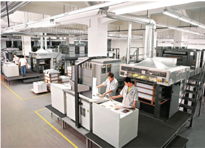
Eco friendly production facilities 環保生產設備