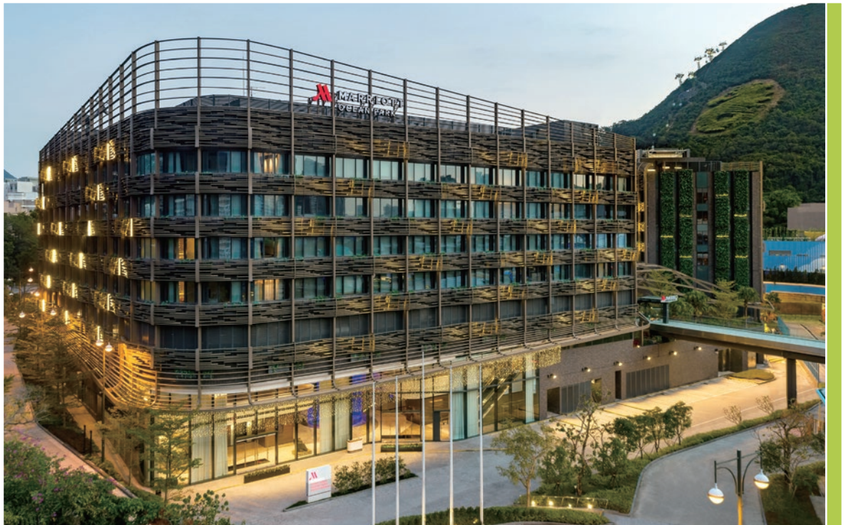
Hotel Exterior 酒店外觀

well as a lagoon-style pool, a tranquil spa and the largest pillarless ballroom on Hong Kong's island side with seating for up to 1,200 guests.