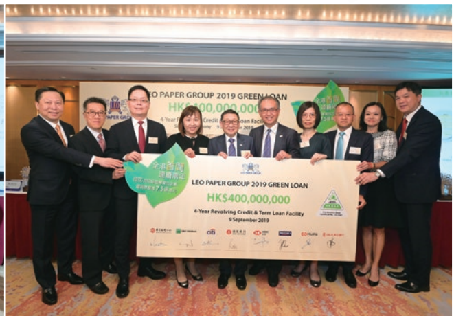
2019 Green Loan Signing Ceremony 2019年綠色融資簽約儀式