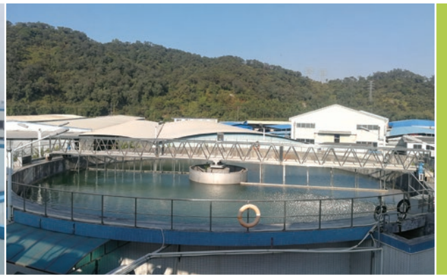
Sewage treatment facility in Xinhui 新會污水處理設施