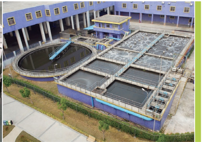
Sewage treatment plant 污水處理廠

“Make good use of resources and cherish the environment” is one of the core values of the Group. Leo continues to promote environmentally friendly materials and cleaner production technologies. To enhance “green” manufacturing capabilities, it not only actively increases the procurement of “green” materials, but also develops products using “green” technologies. The group committed to the implementation of “zero waste” and “zero carbon emissions” workshops. After all, Leo is more determined to reduce manufacturing waste water, reduce carbon emissions, and implement resource reuse all-rounded.